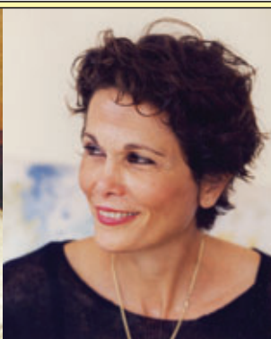
Above is Julia Alvarez; to the mid-left is a painting of Sor Juana Inés de la Cruz.