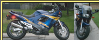
'97 Suzuki Katana for Sale. See Classifieds on Page 10