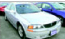
2000 Lincoln $17,990 Deluxe interior, chrome wheels, automatic, wood grain [26201-B]

Mail to: MATHEWS FORD, 2811 Navarre Ave., Oregon, Ohio 43616 By signing above, I understand you will be checking with credit reporting agencies and that the information provided by me is correct.