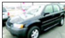
2004 Ford Escape SAVE Only 3,000 miles, 4x4, AM/FM, CD, Power Windows, Locks [P4366]