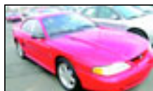
1995 Ford Mustang Cobra 5-speed, AM/FM Cassette, CD, Power MUST SEE! [26647-A]