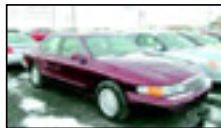
1996 Lincoln Continental $6,990 Leather, CD, Power [P4306-A]