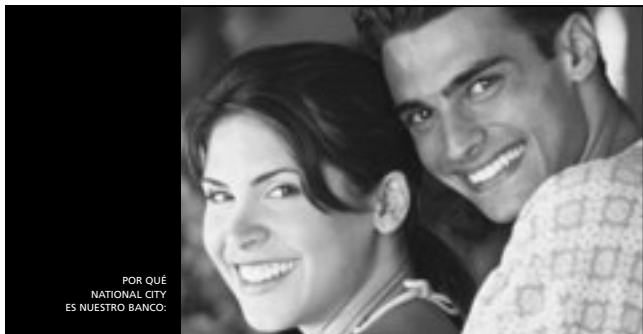
FOR QUÉ NATIONAL CITY ES NUESTRO BANCO:

“Estamos convirtiendo a nuestra casa en un hogar de ensueño.”