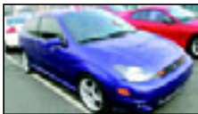
2002 Ford Focus SV $12,990 6-speed, Moonroof, CD, Power Windows, Locks [25813-A]