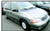
2003 Ford Windstar LX $17,990 V6, Auto, AC, AM/FM, CD, Power Windows, Locks [P4362]