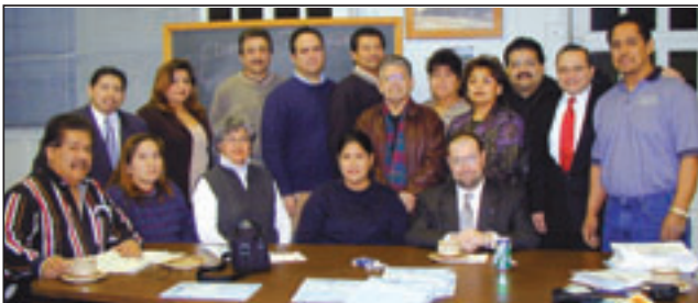
Northwest Ohio's Hispanic/Latino Chamber of Commerce