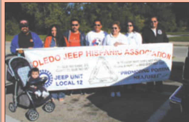
Jeep's Hispanic Local 12 enjoyed Adelante's parade—see page 4