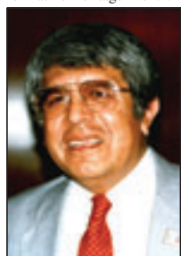
Judge Joseph Flores