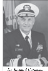
Dr. Richard Carmona

Carmona, who was born in New York and whose family is from Puerto Rico, said he has encouraged diversity in the U.S. Public Health Service Commissioned Corps, an organization consisting of federal public health care professionals. About a third of the people in the corps are ethnic minorities, he said.