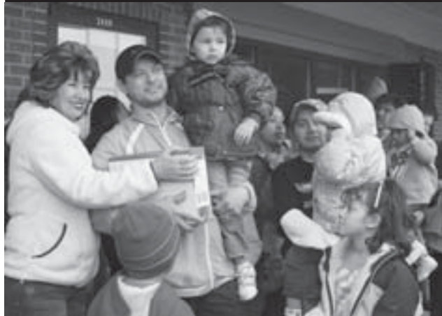
Detroit-based MG Multi-Servicios hosted a Grand Opening of its new office at 2880 E. Washtenaw in Ypsilanti.

Special Edition of La Prensa for Lazo Cultural